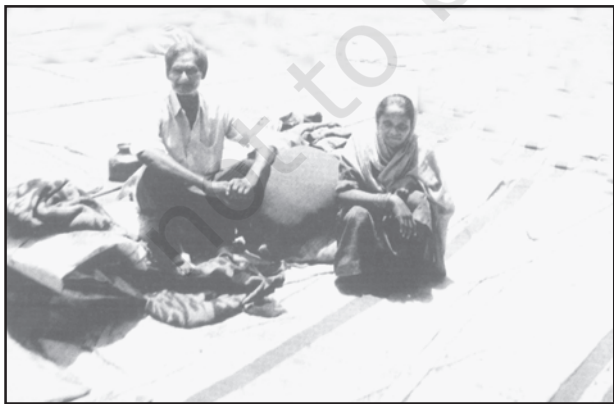
A homeless couple

The sociological imagination enables us to grasp history and biography and the relations between the two within society. That is its task and promise... Perhaps the most fruitful distinction with which the sociological imagination works is between ‘the personal troubles of the milieu’ and ‘the public issues of social structure’... Troubles occur within the character of the individual and within the range of his immediate relations with others; they have to do with his self and with those limited areas of social life of which he is directly and personally aware... Issues have to do with matters that transcend these local environments of the individual and the range of his inner life. The facts of contemporary history are also facts about the success and the failure of individual men and women. When a society is industrialised, a peasant becomes a worker; a feudal lord is liquidated or becomes a businessman. When classes rise or fall, a man is employed or unemployed; when the rate of investment goes up or down, a man takes new heart or goes broke. When wars happen, an insurance salesman becomes a rocket launcher; a store clerk, a radar man; a wife lives alone; a child grows up without a father. Neither the life of an individual nor the history of a society can be understood without understanding both... (Mills 1959).