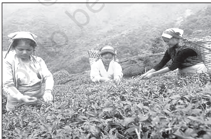
Tea pickers in Assam

Other changes have also redefined the nature of sociology and social anthropology. Modernity as we saw led to a process whereby the smallest village was impacted by global processes. The most obvious example is colonialism. The most remote village of India under British colonialism saw its land laws and administration change, its revenue extraction alter, its manufacturing industries collapse.