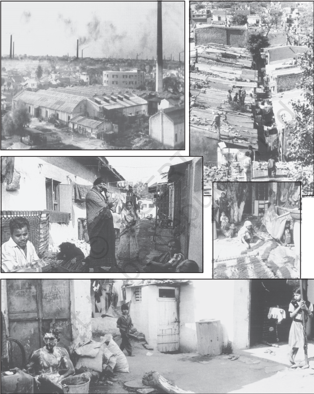
From working class neighbourhoods to slum localities